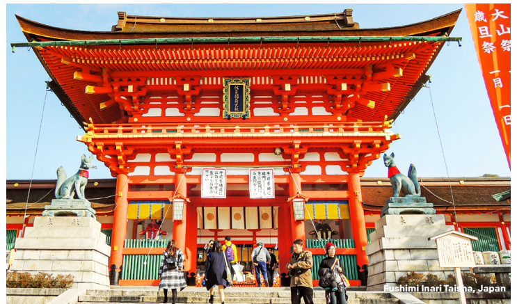
Fushimi Inari Taisha, Japan

Modern Japan retains much of its traditional charm, where ancient customs infuse daily life. Explore the true highlights of Japan on this fascinating adventure. Discover Tokyo, where ornate temples and glass skyscrapers reside effortlessly alongside each other. Be amazed at the beauty of Mt Fuji, experience an authentic ryokan guesthouse in Hakone, ride the bullet train to cultural Kyoto, and pay tribute in moving Hiroshima.