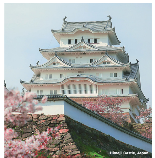
Himeji Castle, Japan

Airfare supplements apply for upgrades Deposit of $500pp due within 7 days of booking Progress payment 30 days after booking Final payment due 90 days prior to travel